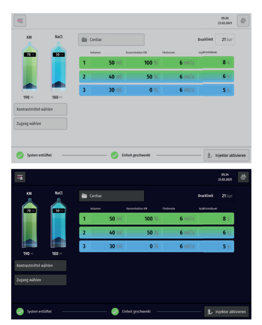
Graphical user interface will be available in English once Accutron® CT-D Vision is commercially available.

Inside the exam room, the choice of the light mode display on the injector screen enhances the readability of key parameters. In the low light of the console room, the operator can choose the dark mode display to reduce visual disturbances and allow the focus on the imaging procedure.