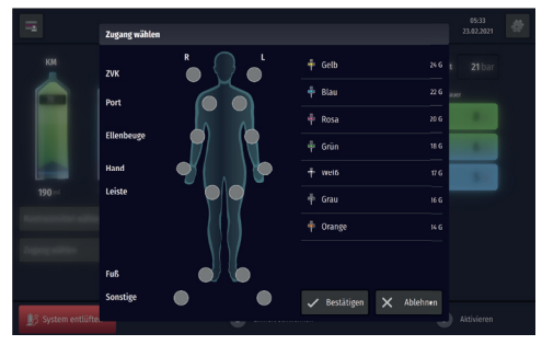
Graphical user interface will be available in English once Accutron® CT-D Vision is commercially available.

Trackability of contrast administration does not only mean recording the contrast dose. It also involves the way the dose was administered. By recording the puncture site location and the size of IV catheter as well as the contrast media type directly as part of the injection data, Accutron® CT-D Vision provides comprehensive trackability and documentation of contrast administration.