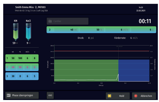
Graphical user interface will be available in English once Accutron® CT-D Vision is commercially available.

It visually highlights the key parameters. Choosing and selecting from lists and a saved profiles library now simplify exam management. This leads to an easier, clearer and more precise programming in less time.