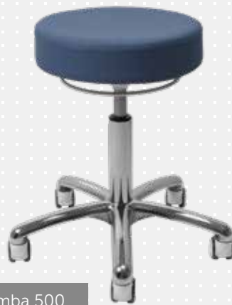
VELA Samba 500