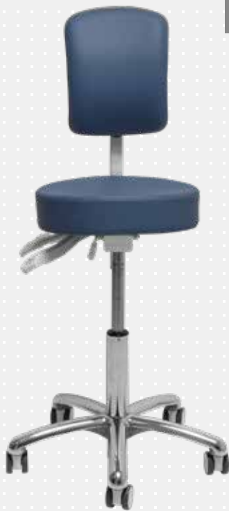
VELA Samba 520