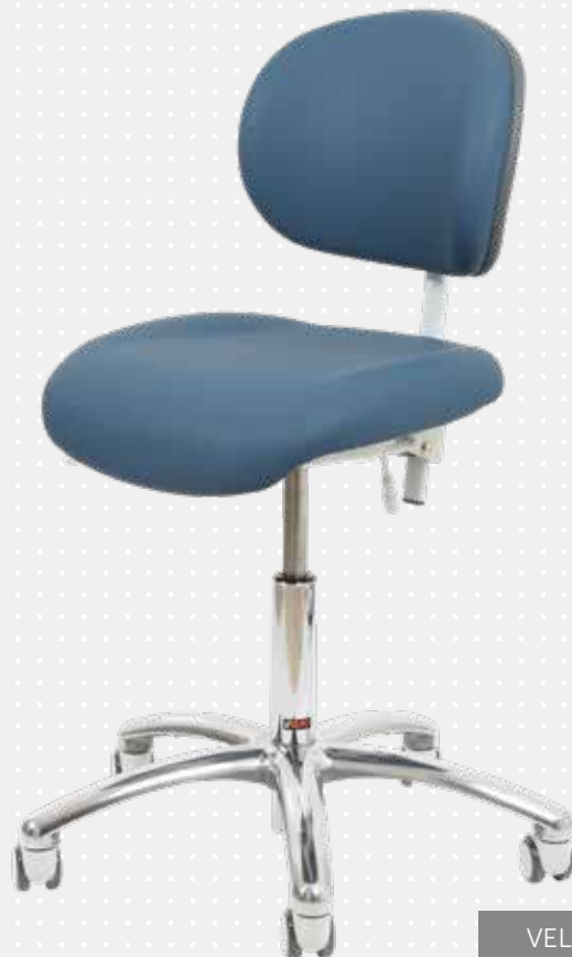
VELA Latin 100