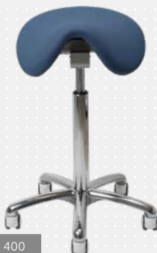
VELA Samba 400