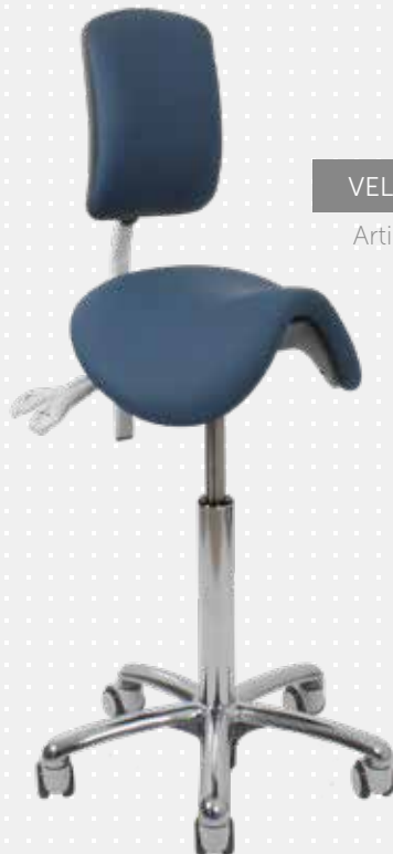
VELA Samba 420