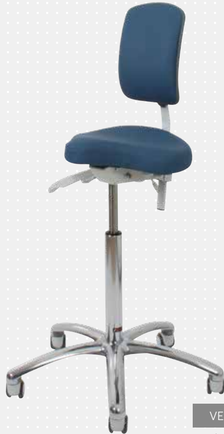
VELA Samba 120